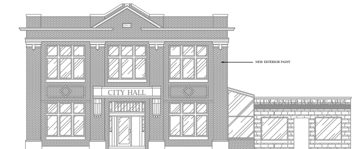
EAST ELEVATION SCALE: 1/4" = 1'-0"